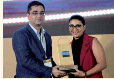
★ Inorbit Mall, Malad, Mumbai