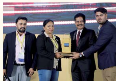
South: Forum Mall, Bengaluru