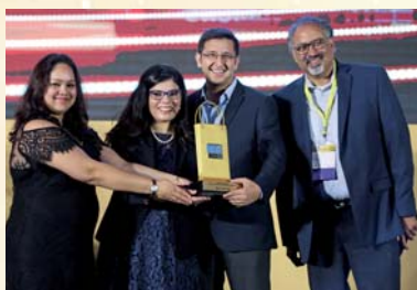
North: ★ Select Citywalk, Delhi