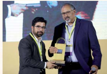
North: ★ DLF Mall of India, Noida