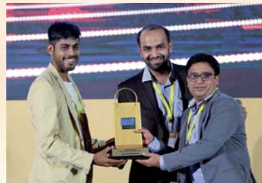
West: ★ Infiniti Mall, Mumbai