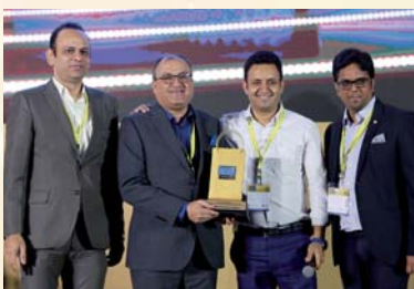
South: ★ Orion Mall, Bengaluru