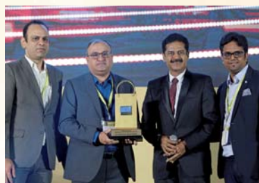
South: ★ Orion Mall @ Brigade Gateway, Bengaluru