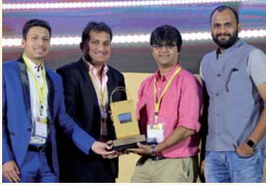
★ Nucleus Mall, Ranchi