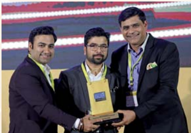
North: ★ DLF Mall of India, Noida