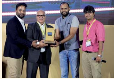
★ Westend Mall, Pune