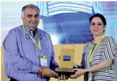
East: ★ Quest Mall, Kolkata