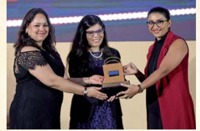
★ Shipra Mall, Ghaziabad managed by Select Citywalk