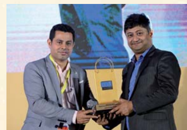
East: ★ South City Mall, Kolkata