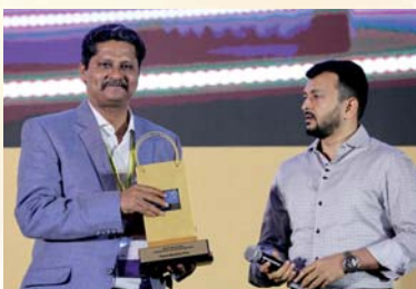
West: ★ Phoenix Marketcity, Mumbai